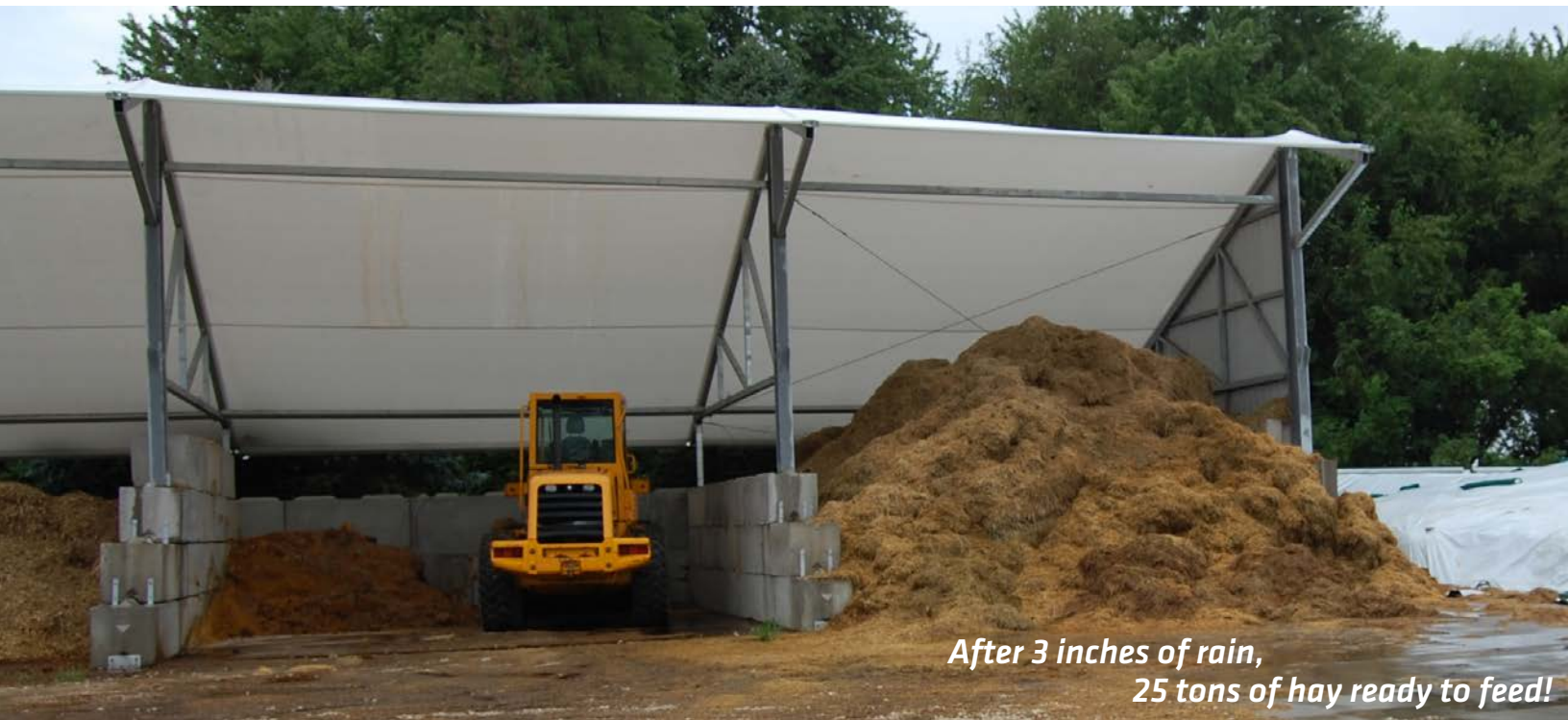
After 3 inches of rain, 25 tons of hay ready to feed!