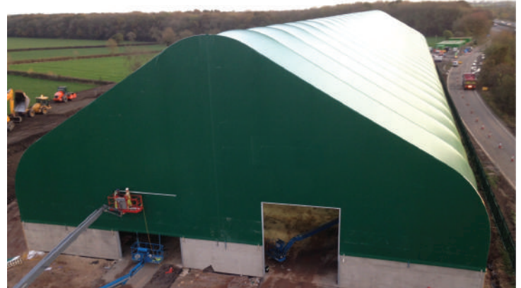
Accu-Steel Integrity Building