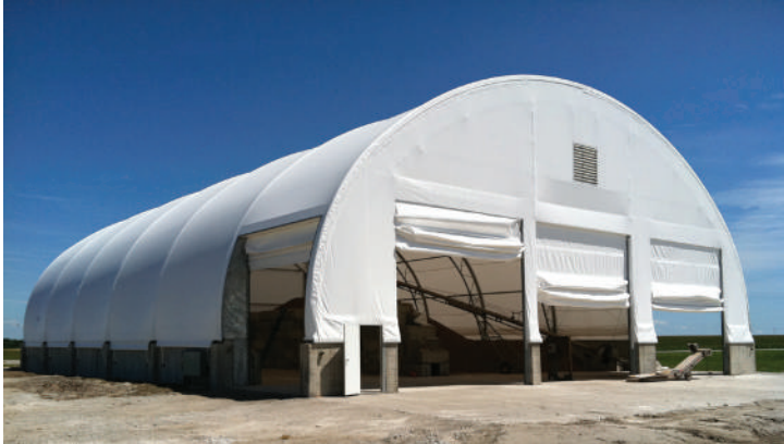
Accu-Steel Pro-Advantage Building